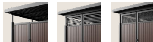
OPEN SLATS PERFORATED