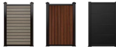
HORIZONTAL PLANK VERTICAL PLANK PLANAR