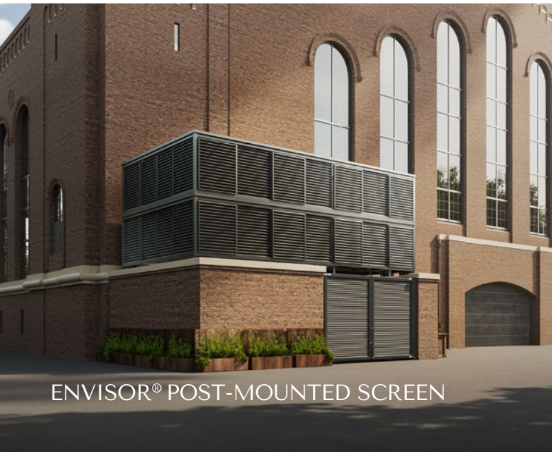
ENVISOR® POST-MOUNTED SCREEN