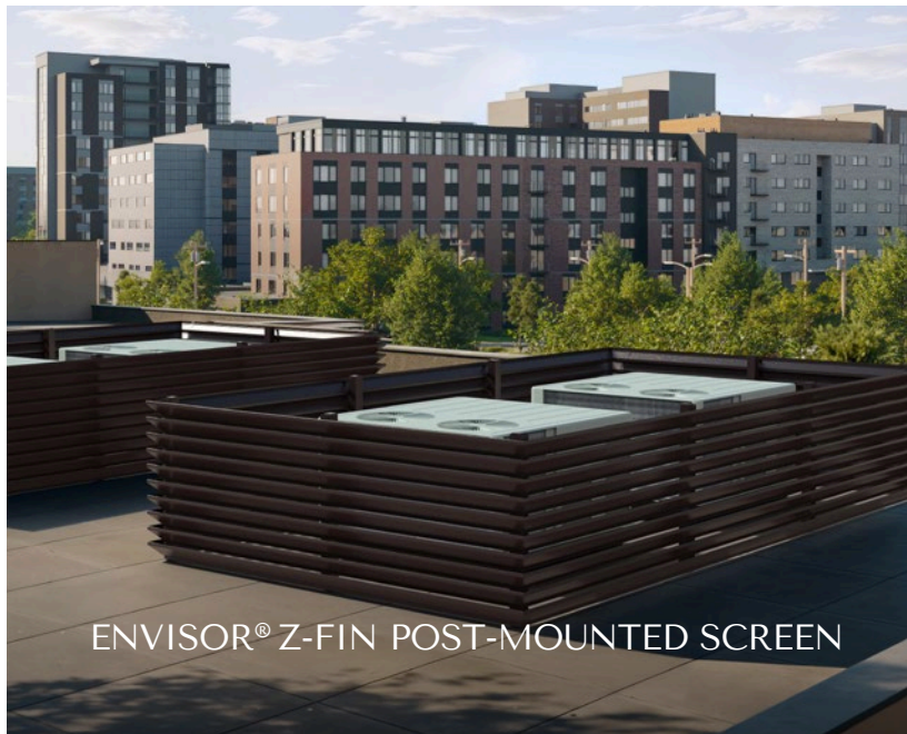
ENVISOR® Z-FIN POST-MOUNTED SCREEN