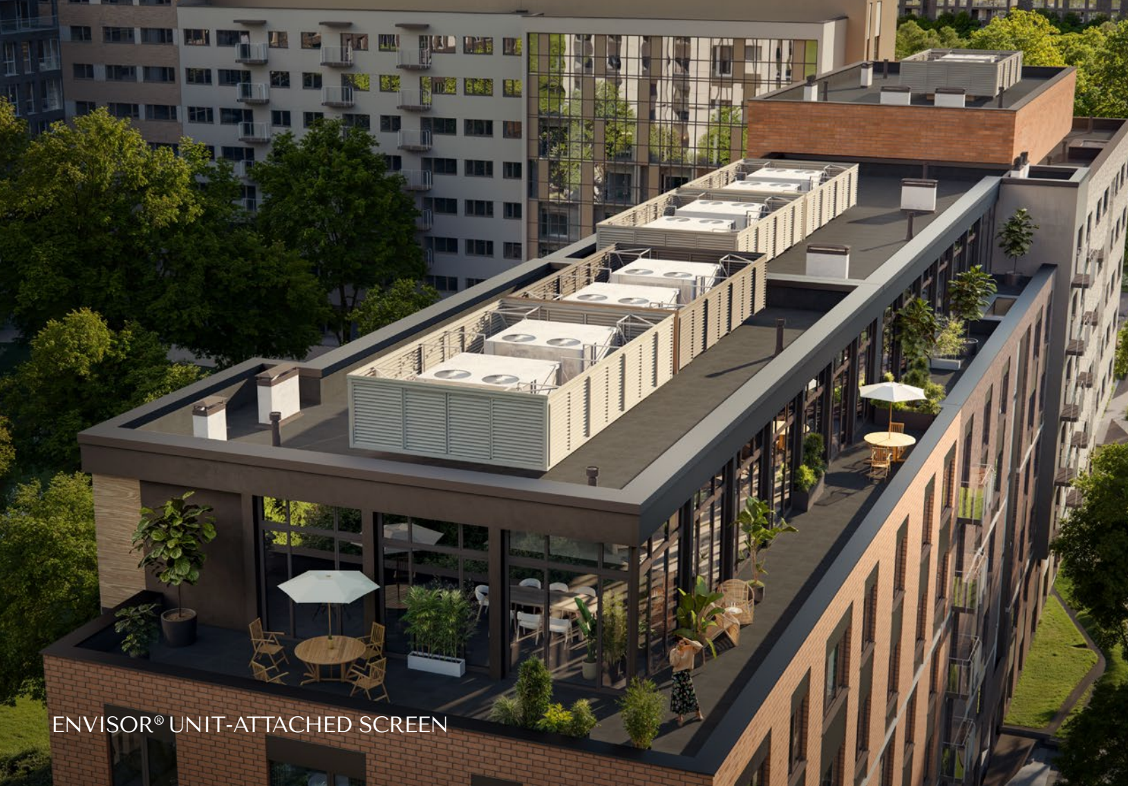
ENVISOR® UNIT-ATTACHED SCREEN