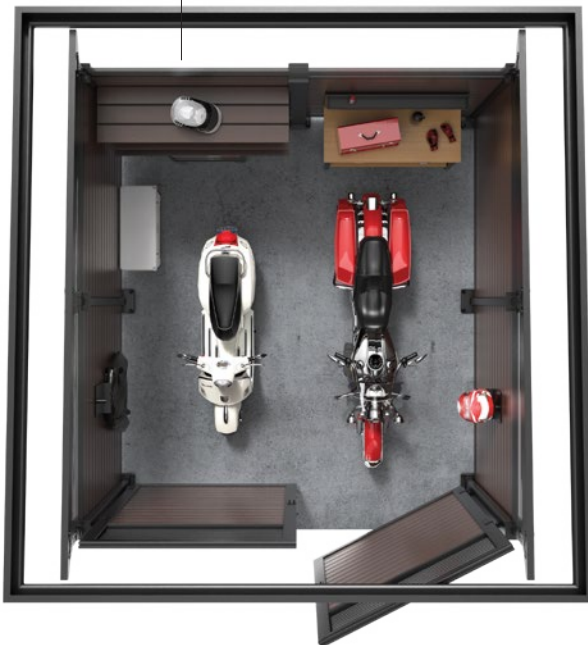
Optional integrated shelving.

COVRIT® GOES BEYOND CONCEALMENT — IT REDEFINES OUTDOOR STORAGE.