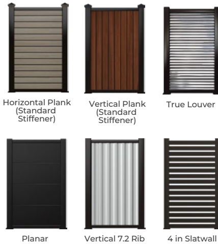
Horizontal Plank (Standard Stiffener)