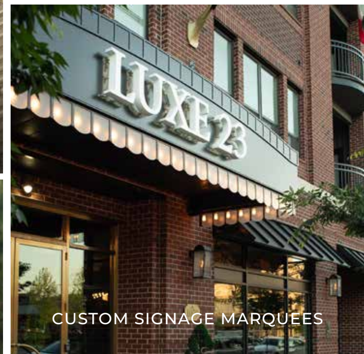
CUSTOM SIGNAGE MARQUEES